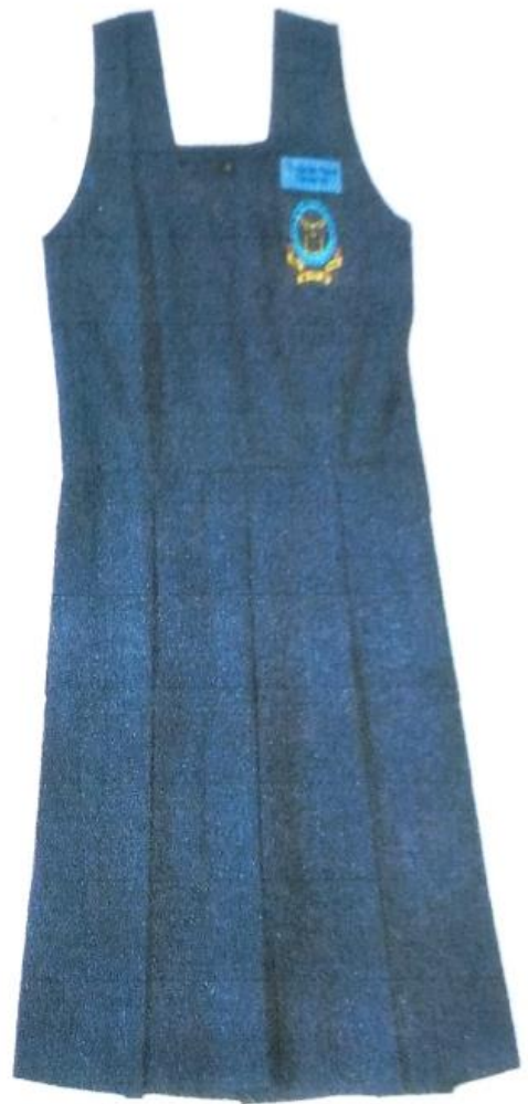
TUNIC FOR LKG/UKG [ LOGO (7 CM X 6 CM) ]