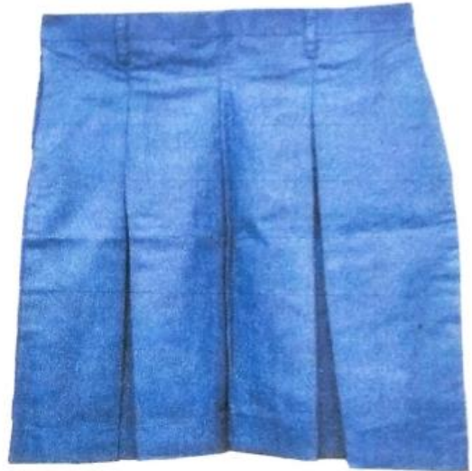
SKIRT FOR CLASS I-VIII