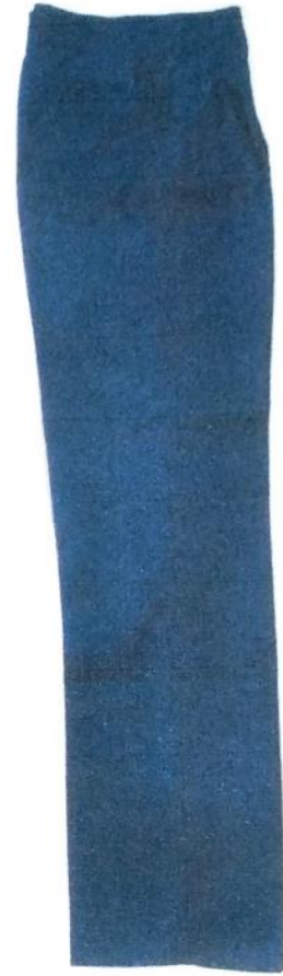
TROUSERS FOR CLASS VI-XII