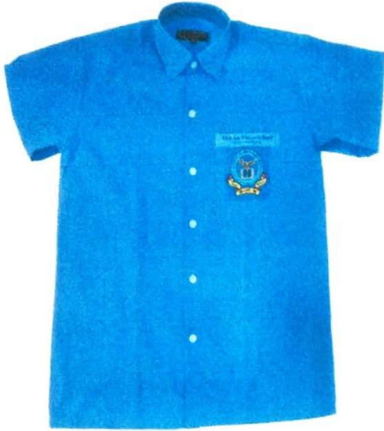
SHIRT FOR CLASS VI-XII LOGO (7.5 CM X 7 CM) FOR MIDDLE CLASSES LOGO (9 CM X 7.5 CM) FOR SEC & SR SEC CLASSES