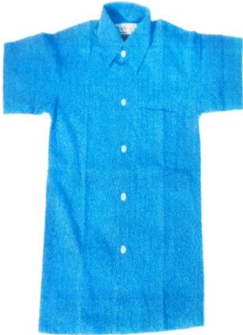
SHIRT FOR LKG/UKG