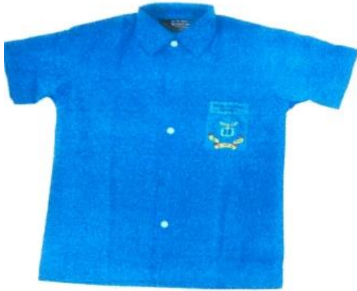
SHIRT FOR CLASS I-VIII LOGO (7 CM X 6 CM) FOR PRE-PRIMARY & PRIMARY CLASSES (LKG TO V) LOGO (7.5 CM X 7 CM) FOR MIDDLE CLASSES (VI TO VIII)