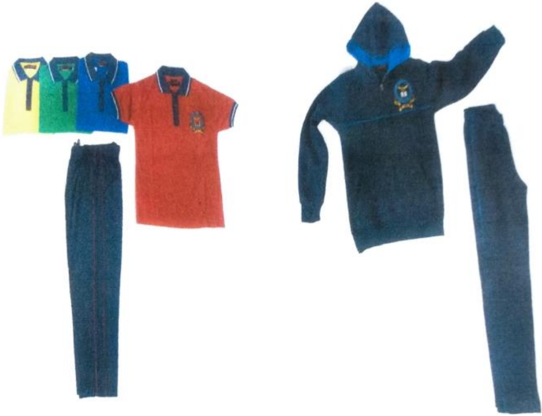
T SHIRT WITH TRACK PANT